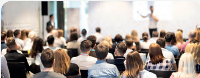
CONFERENCES AND LECTURES