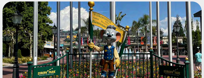
(INDOOR) LEISURE ACTIVITIES