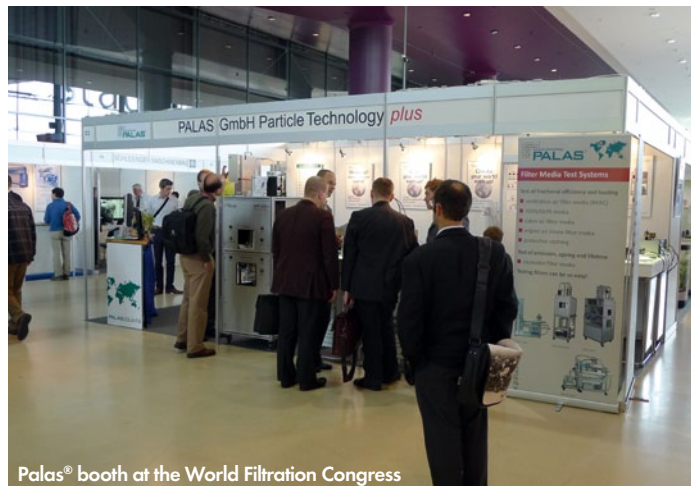
Palas® booth at the World Filtration Congress

Due to the great interest in our products and many interesting contacts, we see a very positive balance and already look forward to the next World Filtration Congress 2016 in Taipei, Taiwan.