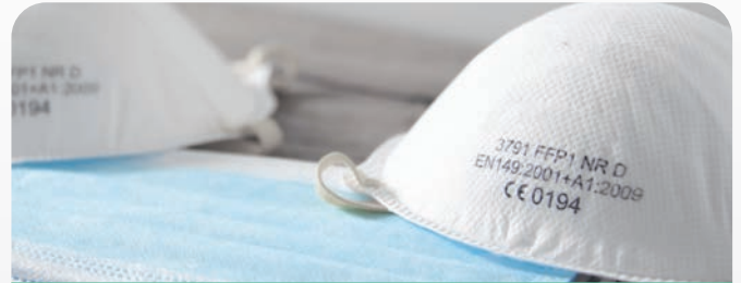
PROTECTIVE MASK MANUFACTURERS