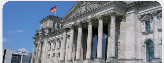
GOVERNMENT & CUSTOMS