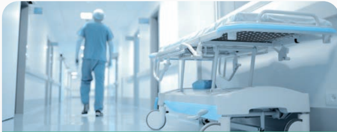
HOSPITALS & RETIREMENT HOMES