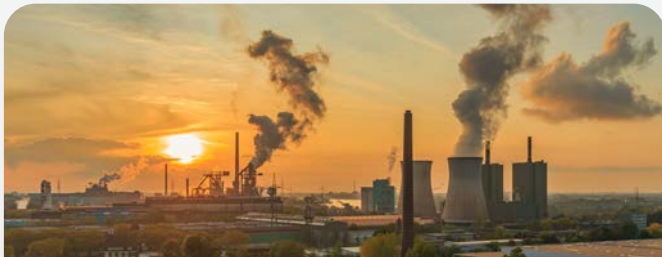
EMISSION SOURCE ALLOCATION