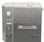
PLG 2100 S Version of the PLG 2100 with automatic refill unit