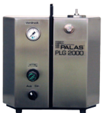
PLG 2000 HS Heated version of the PLG 2000 with automatic refill unit