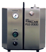
PLG 2000 H Heated version of the PLG 2000 up to 100°C