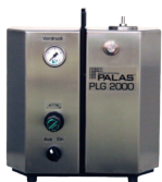
PLG 2000 HS Heated version of the PLG 2000 with automatic refill unit