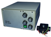
CD 2000 Type A Bipolar discharge unit with lower mixed air flow